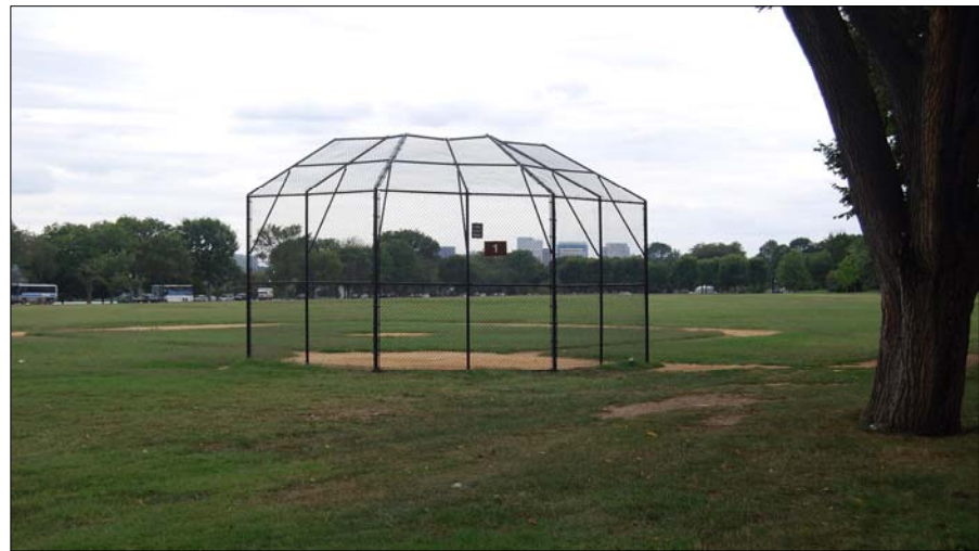
West Potomac Park provides large recreation fields.