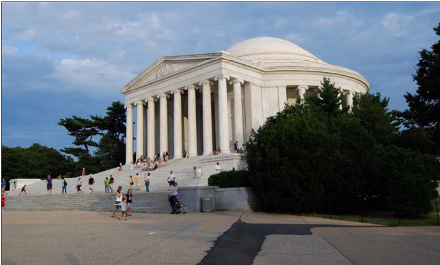
Sinking walls in front of the Thomas Jefferson Memorial plaza are being addressed under the American Recovery and Reinvestment Act of 2009.