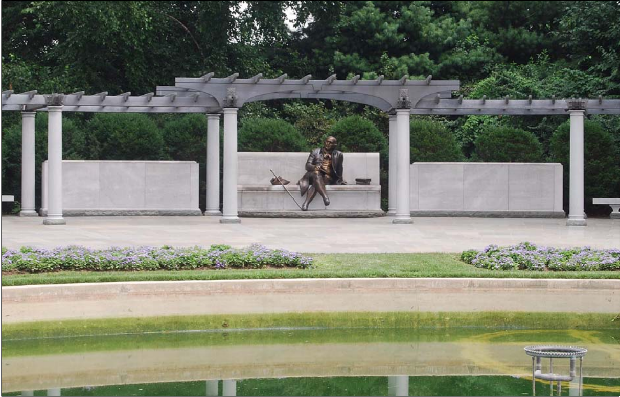
The George Mason Memorial is in a secluded garden area off Ohio Drive SW. Inscriptions may be difficult to read and vines are not well established on the pergola. The historic pool needs rehabilitation.