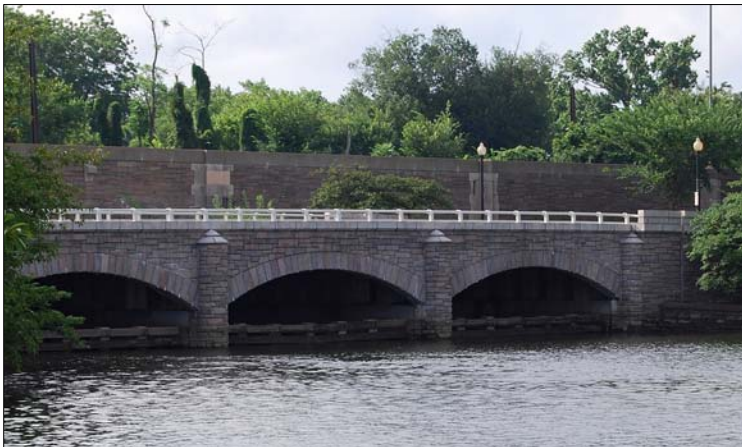
Outlet Bridge flushes the Washington Channel.