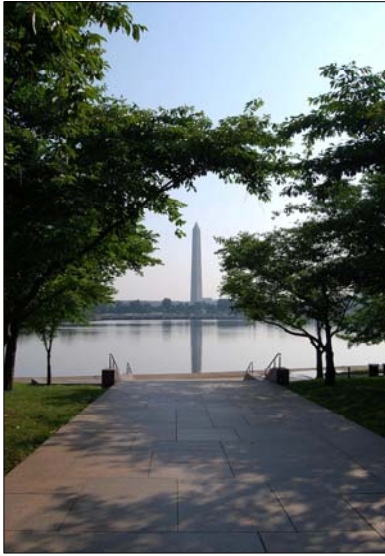
The memorial's location west of the Tidal Basin takes advantage of the classic views of the Washington Monument, as well as the Thomas Jefferson Memorial.