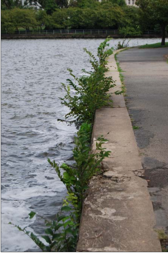
Vegetation growing in the dry-laid seawall requires continual maintenance.