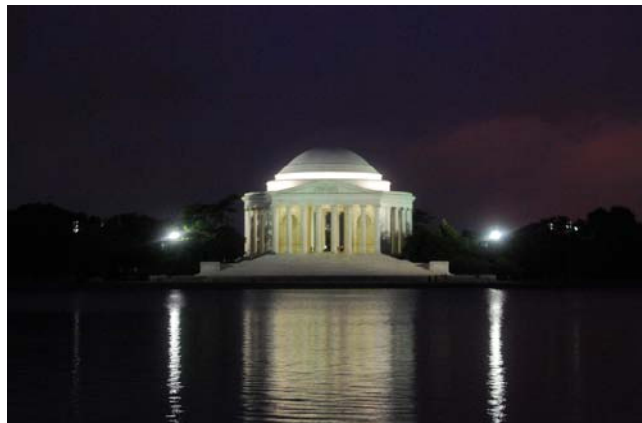
The Thomas Jefferson Memorial at night.