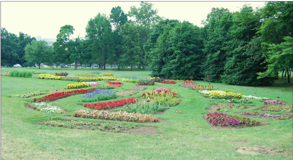
The Annual Library south of Independence Avenue is one of the few areas on the National Mall where color is added with flowering plants — tulips in the spring and annuals in the summer.