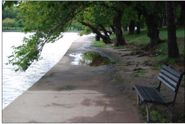
Low-hanging cherry tree branches contribute to the ambience of the Tidal Basin walkways, but sometimes interfere with access.