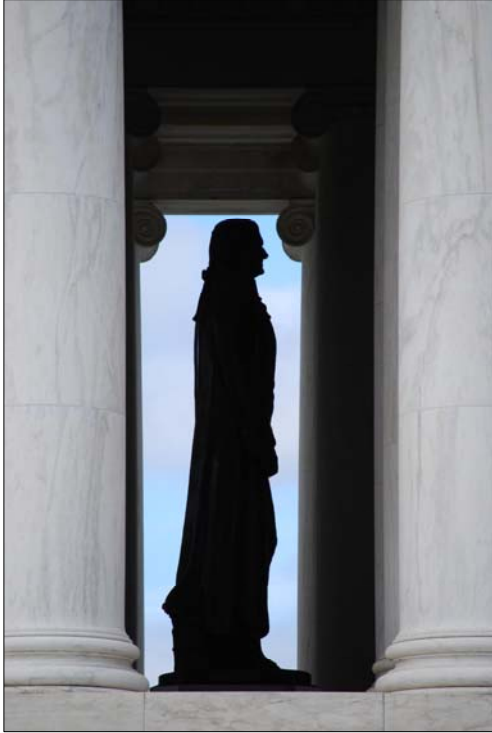
The Thomas Jefferson Memorial from the south.