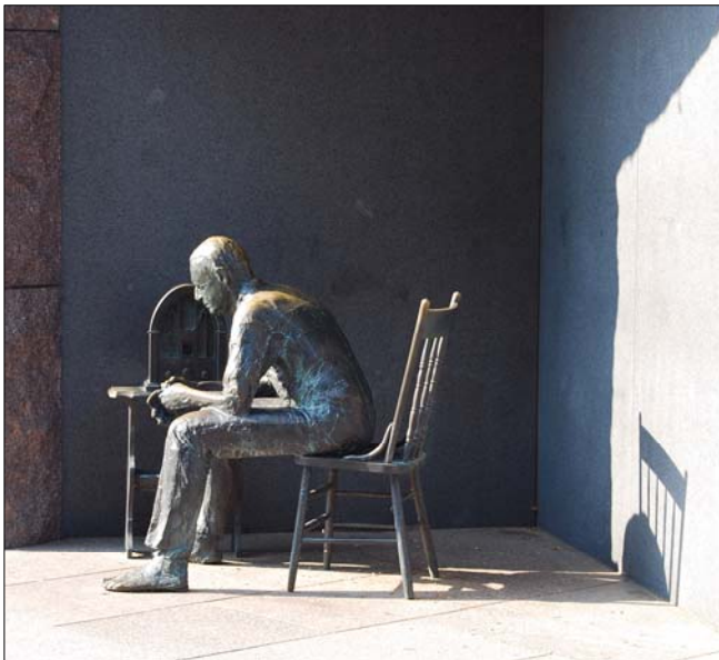
Bronze sculptures and quotations are used to characterize each of Roosevelt's four terms as president.