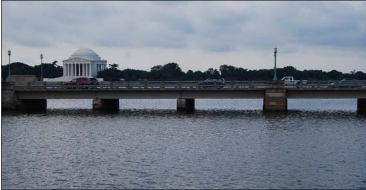
Sidewalks on Kutz Bridge are too narrow for more than two people to walk side-by-side. Access is extremely difficult for visitors in wheelchairs and for bicyclists.