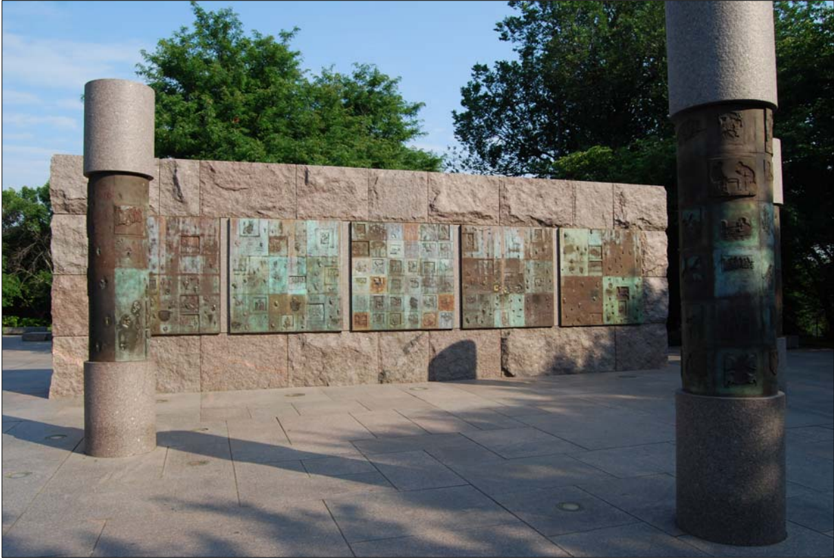
The variety of sculpture creates interesting ways for visitors to reflect on this period of U.S. history.