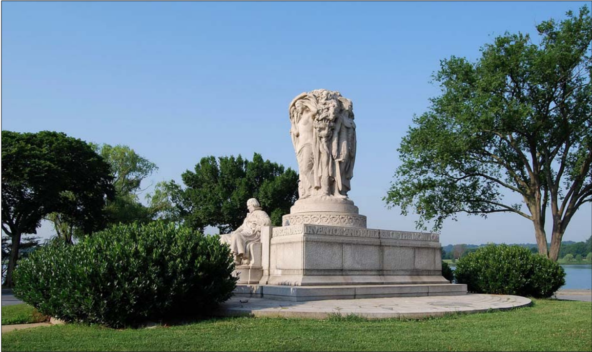
The John Ericsson Memorial is along Ohio Drive, south of the Lincoln Memorial. An interpretive exhibit across the street tells about the inventor.