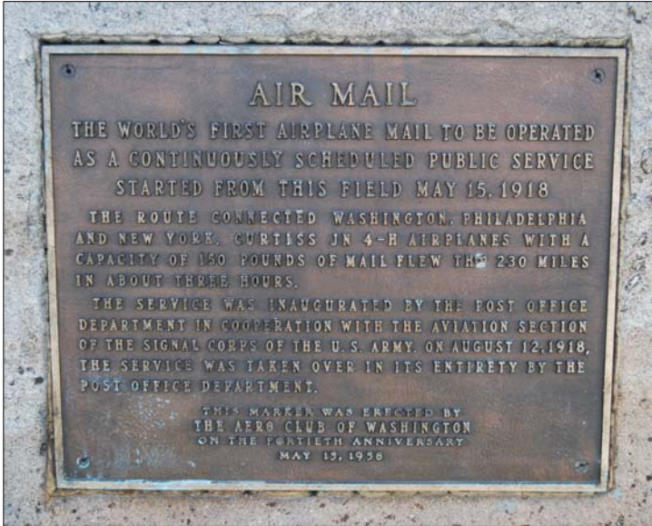
The First Air Mail Memorial is along the West Potomac Park Riverfront. Few visitors are aware of its existence.