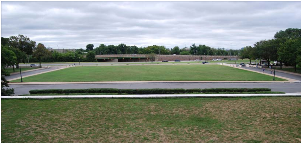
The former parking area south of the memorial could be redesigned to accommodate a security perimeter, as well as demonstrations and special events.