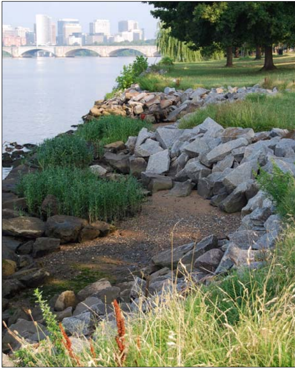
Riprap has been installed because of deteriorating rock walls.