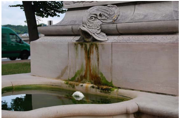
Side fountain on the memorial.