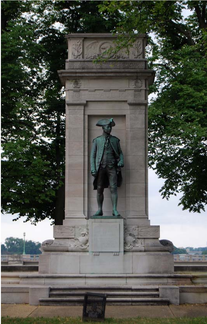
The John Paul Jones Memorial is on a traffic island in 17th Street at Independence Avenue.