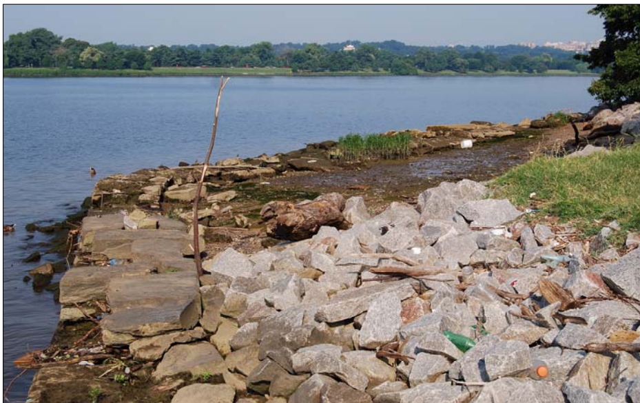
Looking northwest from near Inlet Bridge.